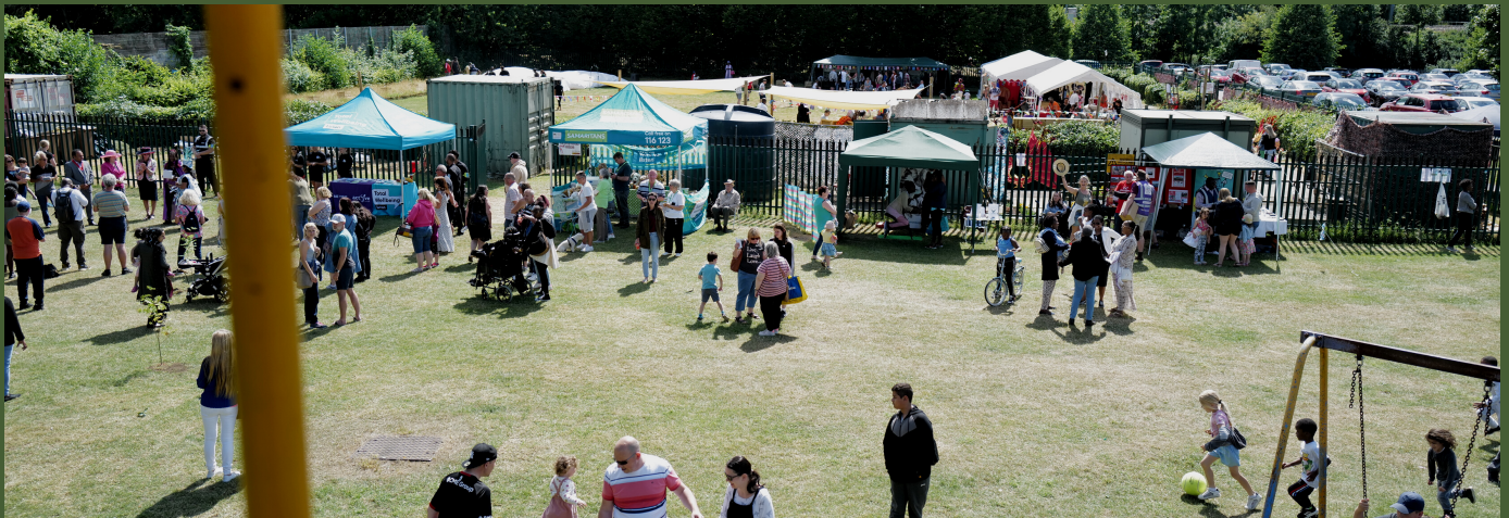
Piece By Peace Community Hub and Garden Projects

Community Festival Art & Culture Activities Conservation and Gardening Queendom The Other 33