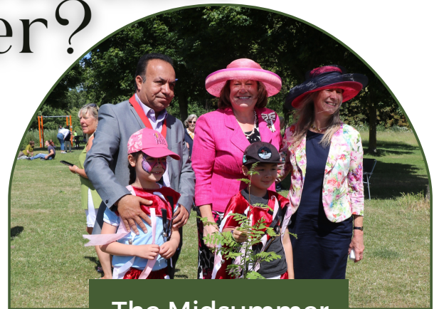
The Midsummer Jubilee Festival

This is a project that has been decades in the making. We will be creating a Community Hub for Sundon Park, piece by piece, over the coming decade