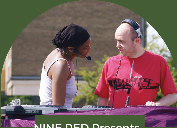
NINE RED Presents... (CIC)

Queens Award Winner Ran by interdisciplinary artists that permanently or temporarily update spaces; and change people, places and spaces with intriguing, thought-provoking and intricate designs and art medicine.