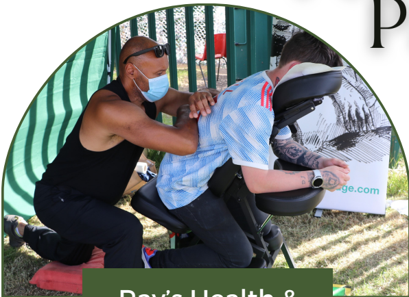
Ray's Health & Wellbeing

Ray's Health and Wellbeing Association provides a variety of holistic health therapies. Including seated NO HANDS® Chair massage, Talk Therapy and Calcicise.