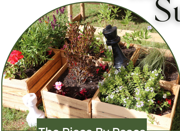
The Piece By Peace Project

This is a project that has been decades in the making. We will be creating a Community Hub for Sundon Park, piece by piece, over the coming decade