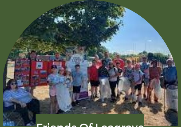
Friends Of Leagrave Park

Queens Award Winner Ran by interdisciplinary artists that permanently or temporarily update spaces; and change people, places and spaces with intriguing, thought-provoking and intricate designs and art medicine.